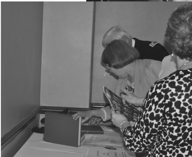
(above) Looking at memories