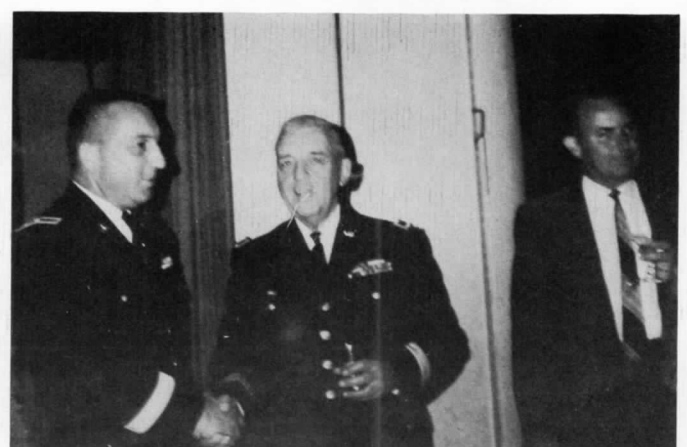
UNTIL THE NEXT MEETING