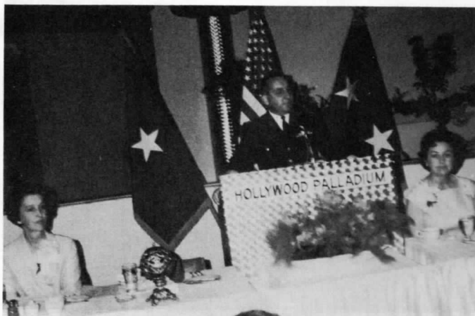
Lt Gen KAUFMAN M-C

6215 SUNSET BOULEVARD • HOLLYWOOD 28, CALIFORNIA • HOLLYWOOD 6-4311