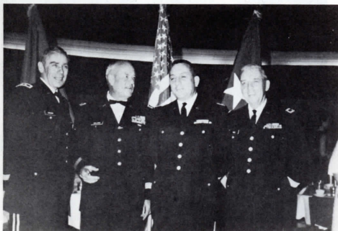
OUR FOUR GENERALS H-K-K-H

6215 SUNSET BOULEVARD • HOLLYWOOD 28, CALIFORNIA • HOLLYWOOD 6-4311